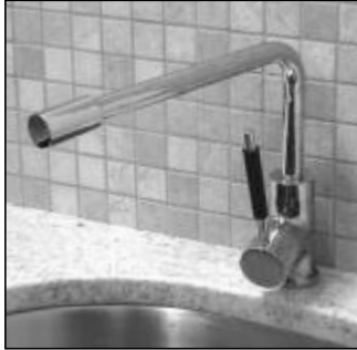
K-670RE: Single Lever Kitchen Faucet 11" Spout. Single Hole Punch