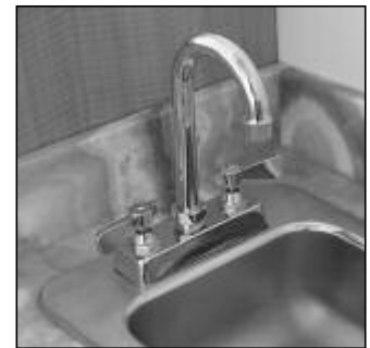
K-62RE: Bar/Prep Sink Faucet 3-1/2" Spout. 4" O.C.