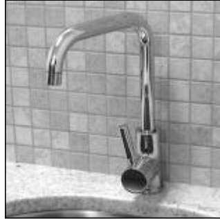
K-635RE: Single Lever Kitchen Faucet 8" Spout. Single Hole Punch