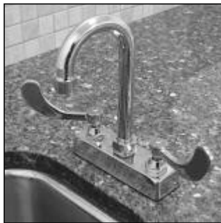
K-56RE: Bar/Prep Sink Faucet 3-1/2" Spout. 4" O.C.