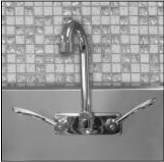
K-316RE: 3-1/2" Utility Sink Faucet 3-1/2" Spout. 4" O.C.