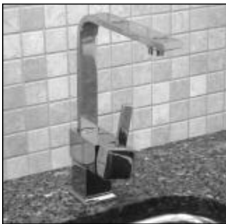
K-680RE: Bar Sink Faucet 6-1/4" Spout. Single Hole Punch