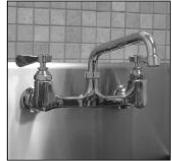
K-105RE: Utility Sink Faucet 8" Spout. 8" O.C.