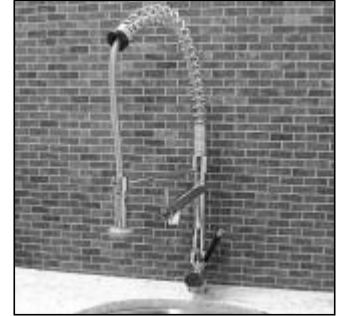
K-695RE: Spray Kitchen Faucet 9" Spout. Single Hole Punch