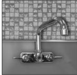
K-123RE: Utility Sink Faucet 6" Spout. 4" O.C.