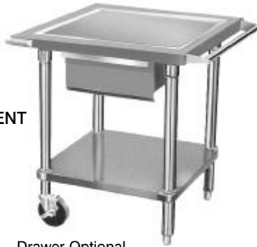
MIXER EQUIPMENT TABLE