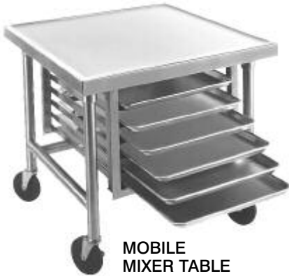
MOBILE MIXER TABLE