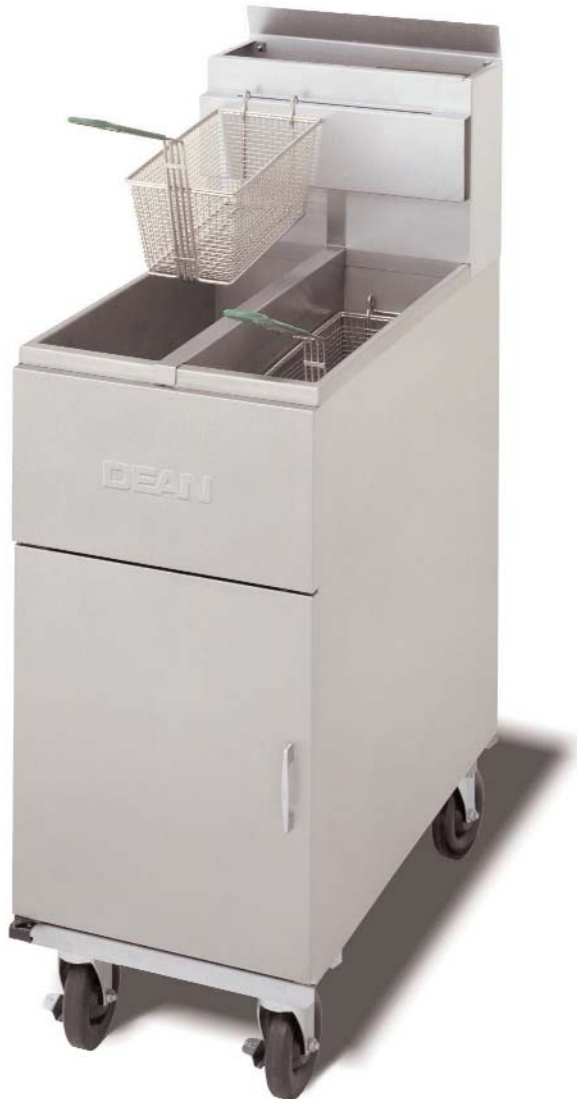
SM20-2 Shown w/optional casters

Designed for small volume and add-on applications