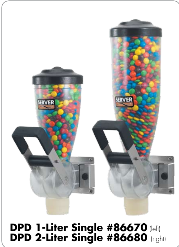
DPD 1-Liter Single #86670 (left) DPD 2-Liter Single #86680 (right)