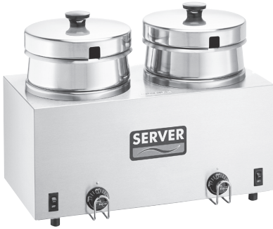
Twin FS-4 81200