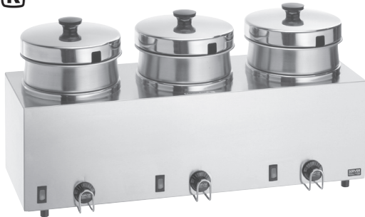
Triple FS-4 85900