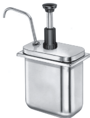
CP-200 #83300 (jar not included)