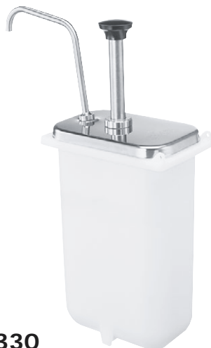
CP-F #83330 (jar not included)