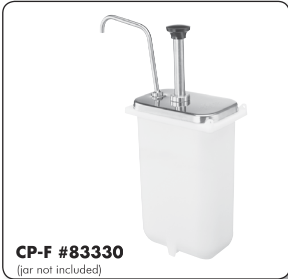
CP-F #83330 (jar not included)