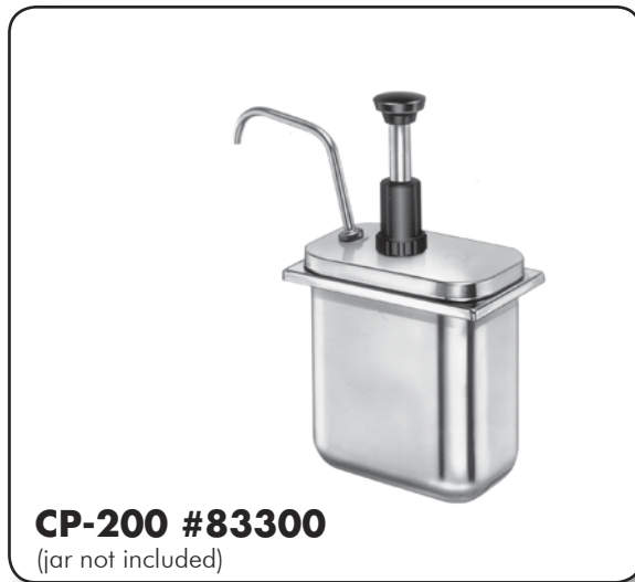
CP-200 #83300 (jar not included)