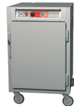
1/2 Height Solid Doors