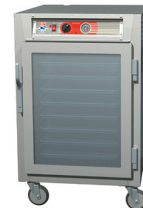
1/2 Height Clear Doors