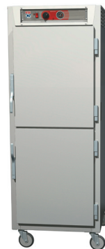
Full Height Dutch Solid Doors

Note: Add an "A" to the end of the cabinet part number when ordering accessories.