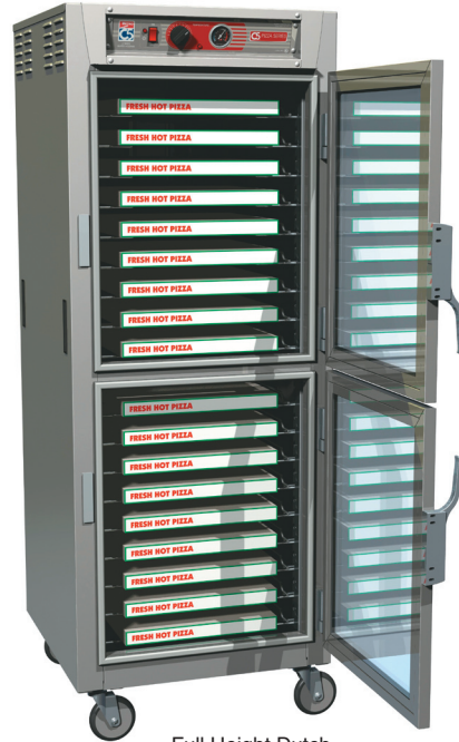
Full Height Dutch Clear Doors